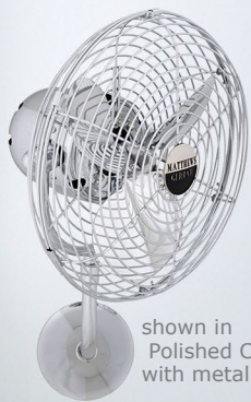
shown in Polished Chrome with metal blades